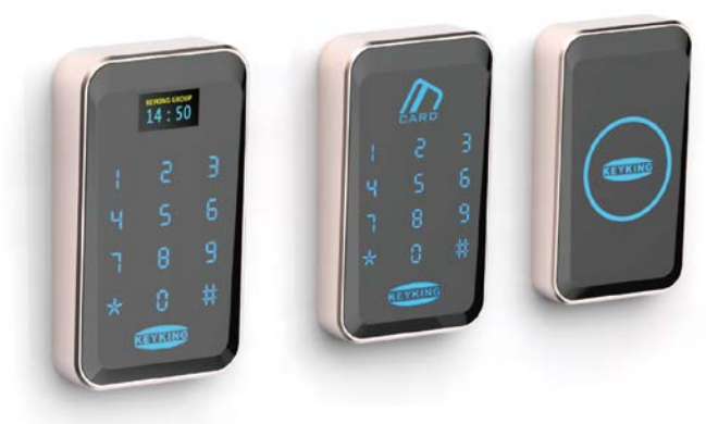
RY02P ( Proximity Reader)